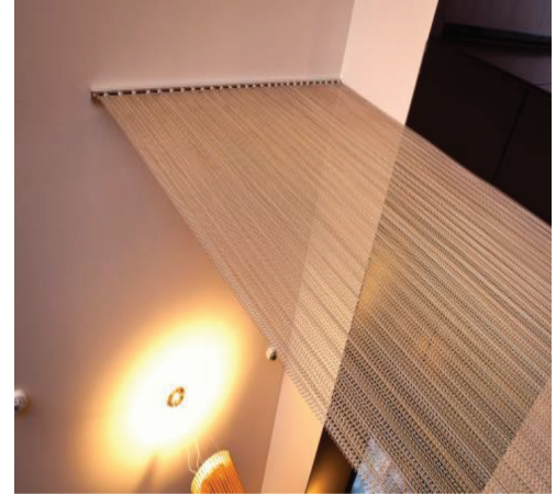
* Typical Architectural Installation