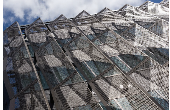
* Typical architectural installation of a perforated metal panel with varying hole sizes.