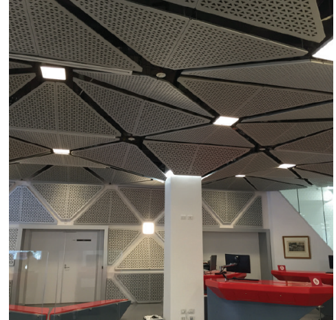
* Typical architectural installation of a perforated metal panel with varying hole sizes.

* OA & Weight calculations are based on .12in (3.0mm) aluminium.