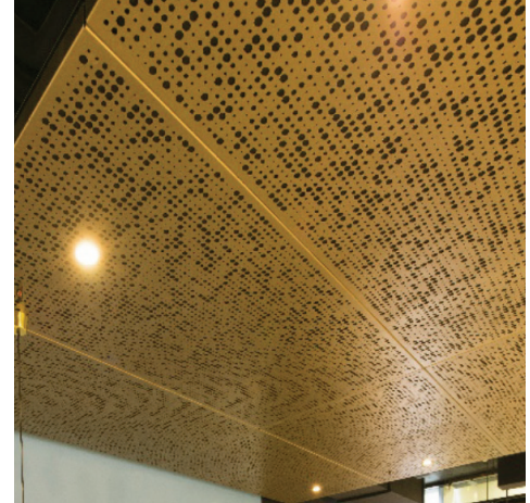
* Typical architectural installation of a perforated metal panel with varying hole sizes.