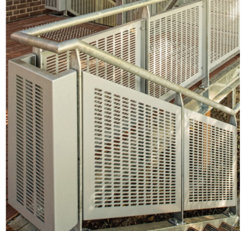
* Typical architectural installation of a perforated metal panel.