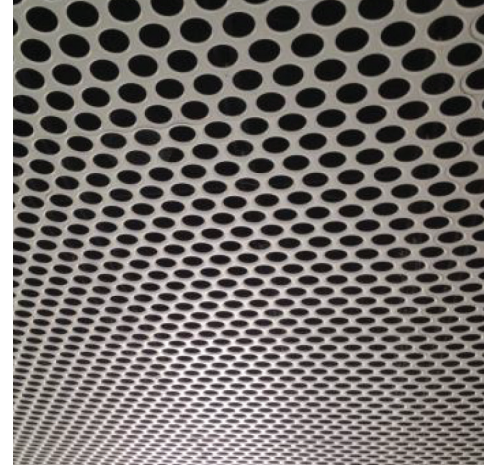
* Typical architectural installation.