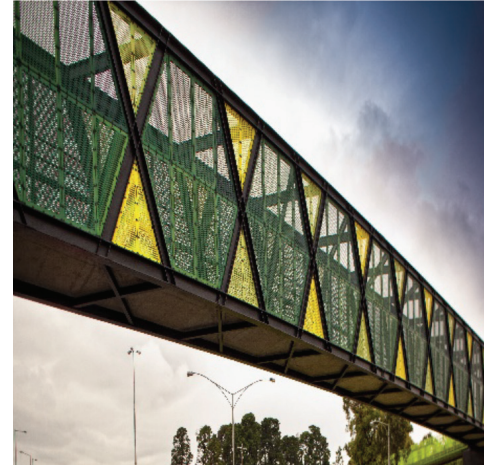
* Typical architectural installation.