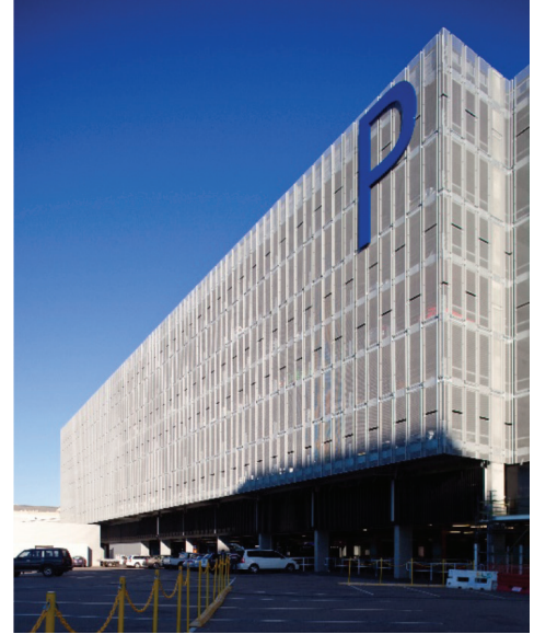
* Typical architectural installation.