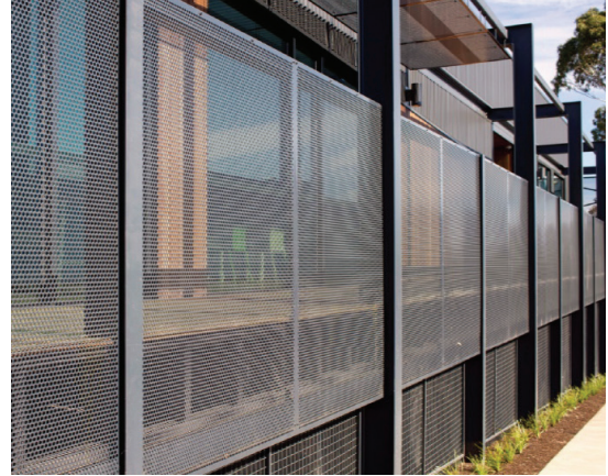
* Typical architectural installation.